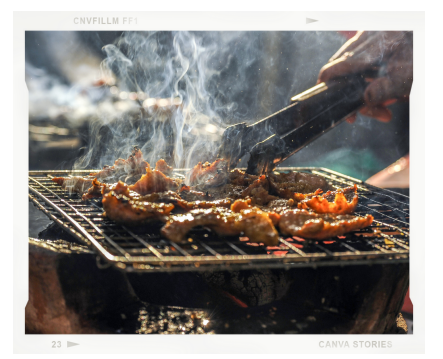
BBQ VENDORS & COOKOFF